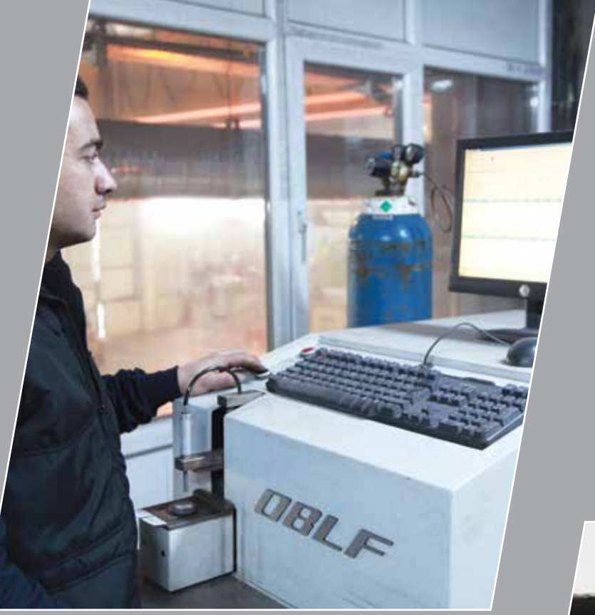
OBLF model 18 element spectrometer