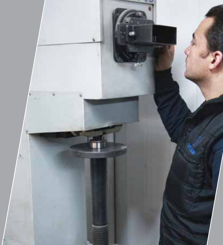
Hardness Measurement Device